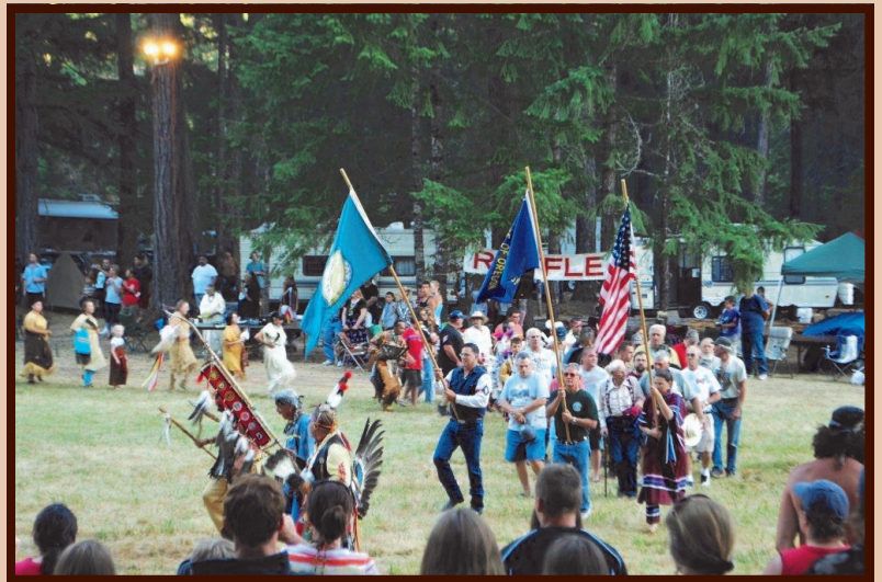
Pow Wow Grand Entry