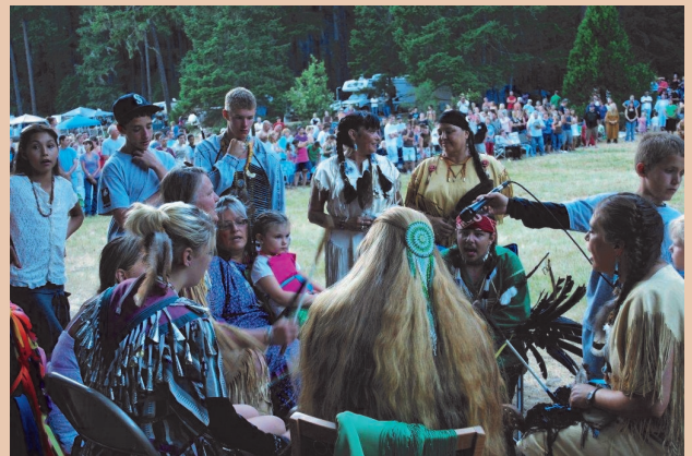
Thundering Waters Drum Group

Tribal Board, Umpqua National Forest Service, Douglas County Sheriffs Office, Seven Feathers, UIDC Maintenance, Glendale Ambulance, set-up & clean up crews, fry bread crew, fish crew, raffle crew, wood crew, security crew and everyone in between. Thank you all for all of your time and effort put forth!