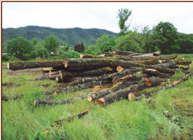
Big leaf maple logs at Weaver Road decked for delivery to McNeil Ranch Firewood Center