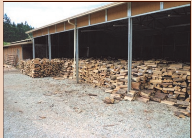
Dozens of cords of firewood await their new home in Tribal members' fireplaces.