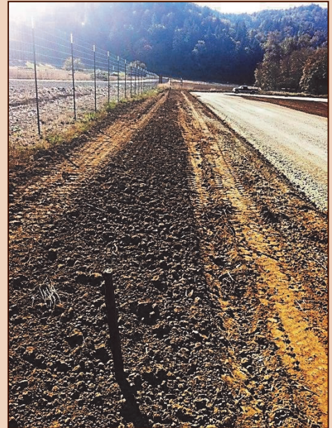
Stakes along the Yokum Road fence line marking areas for Hazelnut trees.