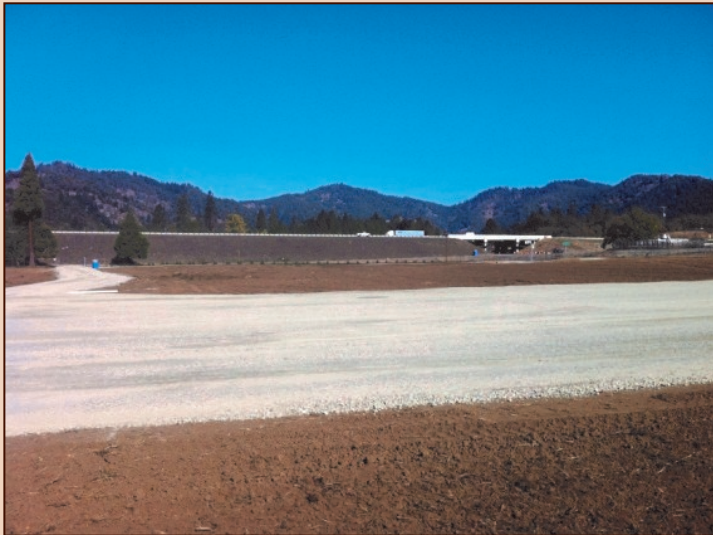
A view of the beautiful soil, new parking area and access road for the Gardens.

Fall has been very busy at the Tribal Gardens. The soil has been worked down in preparation for planting fruit trees in the orchard section. Hazelnut trees will also be planted along the border of Yokum Road to provide for a visual break. Tree planting is scheduled to begin by December. A road and parking lot have been constructed to prepare for Tribal member gatherings and picking events. For more information on the Tribal Garden call Amy Amoroso, Natural Resources Director, at 541-677-5575.