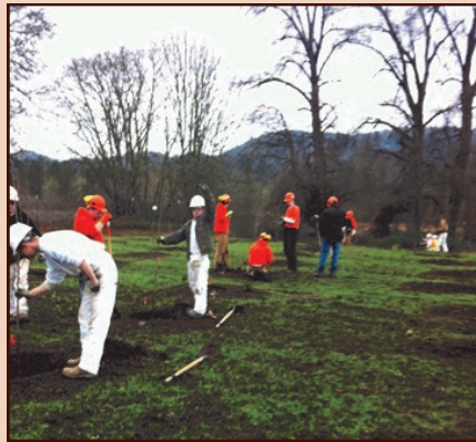
Planting in process