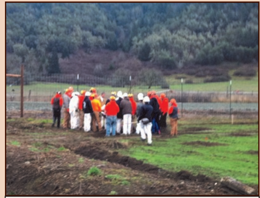
The Crew receiving planting instructions.