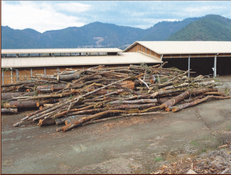
Firewood logs at McNeil Ranch Firewood Center.

It is hard to believe by March's wintry weather, but the calendar says it's spring already, and time to place your firewood order for next winter. We have a nice mix of oak and madrone for high heat output, with a bit of fir and cedar thrown in to get that hot fire started. The wood is currently in log form, but will soon be bucked and split for dry wood this fall.