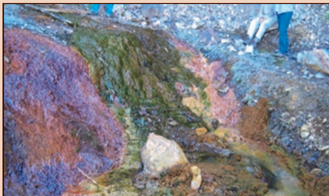
Mine Seepage.

The EPA has been managing the cleanup of the Formosa Mine on Silver Butte near Riddle, Oregon since 2007 when it was declared a superfund site. The agency defines a superfund site as follows “an uncontrolled or abandoned place where hazardous waste is located, possibly affecting local ecosystems or people.” A Remedial Investigation Study was conducted between 2008 and 2011 by EPA and partners to determine the extent of surface mine materials deposited outside of the underground mine. Sampling was done on potentially affected soils, surface water and groundwater to determine the levels of contaminants present.