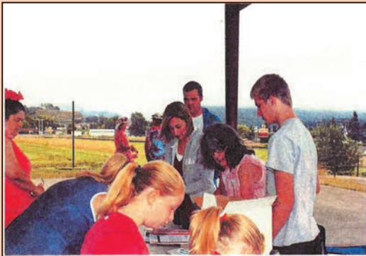
Each athlete was required to fill out a registration form and sign media release so that they could be photographed

ten. Perhaps even the renegade(s) that turned over the portable outhouse the night before the event might find it to their advantage to join in the fun in a positive way the next time.