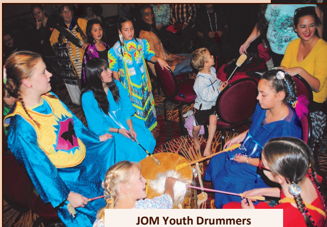
JOM Youth Drummers

We look forward to many more years of growth and new beginnings!!