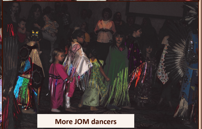
More JOM dancers