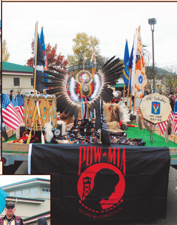
Back view of Cow Creek float