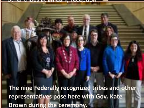
The nine Federally recognized tribes and other representatives pose here with Gov. Kate Brown during the ceremony.

The second proclamation proclaimed May 16 th – 23 rd as American Indian week in the state. Governor Brown said "In honor of the nine federally recognized Tribes in Oregon, I have declared this week to be American Indian Week."