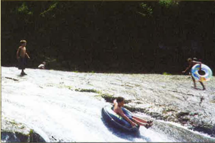
Tubing, sliding, jumping, swimming, and gathering at South Umpqua Falls. Pow-Wow 2001.