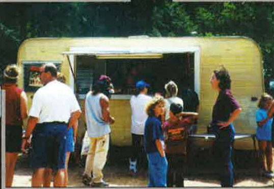
Fry bread booth at Pow-Wow 2001 sold out and had to close down early.