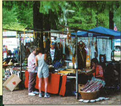
Many vendors participated at Pow-Wow 2001.