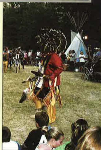
Tribal member in dancing regalia on Saturday night at Pow-Wow.