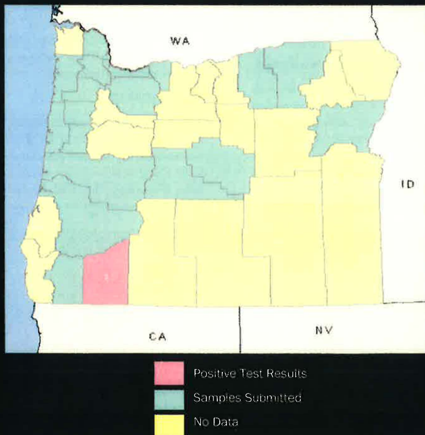
Cumulative Dead Bird Infections by County - as of Aug 09, 2005

Currently in Oregon only avian, animal and/or mosquito infections have been present. Crows, jays, magpies and ravens are being tested. More information is available from the Centers for Disease Control Web site, including information on West Nile and horses, at http://www.cdc.gov/ncidod/dvbid/westnile/ and the National Wildlife Health Center Web site at http://www.nwhc.usgs.gov .