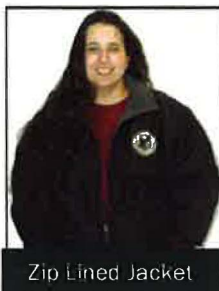
Zip Lined Jacket