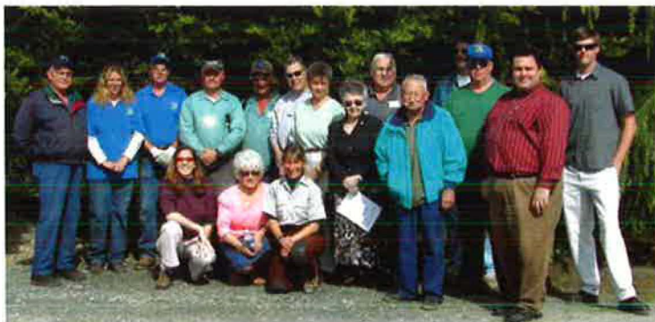
Volunteers and Tribal Staff & Board gathered to release the last batch of smolts in 2006.