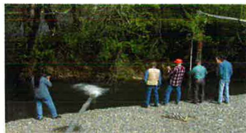
The fish are released into Canyon Creek.