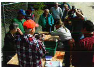
Data collection process of measuring size of fish is important.