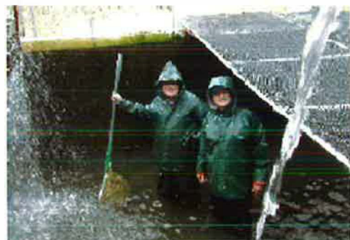
UFA Volunteers in the Acclimation pond.