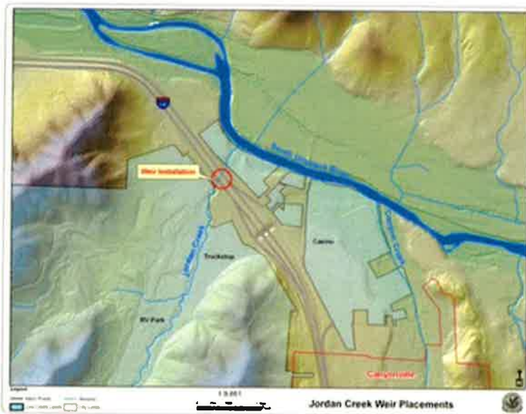
Jordan/Alder Creek map show the placement of notched weirs underneath Interstate 5 to facilitate the passage of fish.