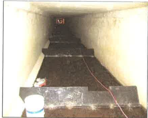
Weir underneath Interstate 5 on Jordan Creek.

The Tribe and ODOT will monitor the presence or absence of fish this coming winter.