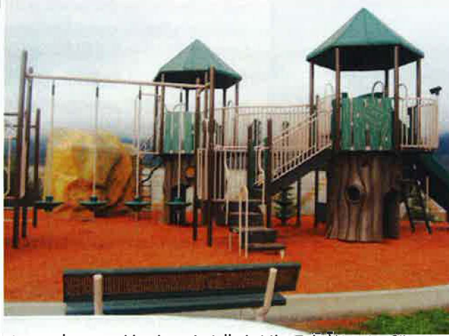
A new playground has been installed at the Tribal Housing Site on Taylor Street in Myrtle Creek.

The Over-the-Counter Medication program has proven to be extremely helpful to tribal families with the expense of approved non-prescription health items related to first aid, general nutrition supplements and other health related items for a total of $80,987.00. ($41,322.87 for in-service area and $39,664.13 for out-of-service area)