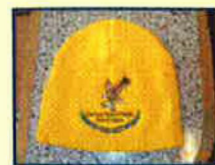
Logo Ski Beanie